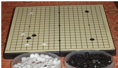
Magnetic Set GSCX2