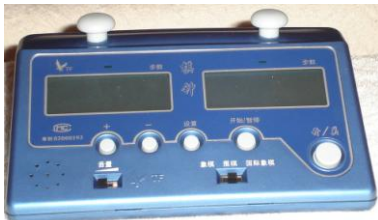
Digital Go Clock