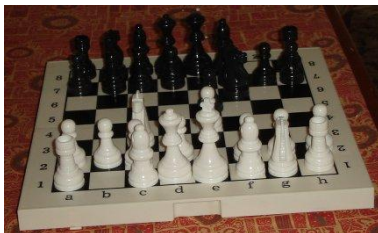
Plastic chess set

A very strong backgammon software where you can play against a computer opponent up to world master in strength. Get hints on plays and the doubling cube. Comes with a nice booklet on the rules and strategy by a world champion. IBM CDROM $44.00