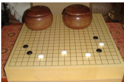
Hiba 5.5cm + chestnut bowls

Contract bridge is played in most countries and is a popular social card game. Try this excellent version, which also has many hints on bidding and play to assist beginners. A FREE Learn to Play Bridge software is included. IBM or MAC $112.20